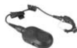
Operations Critical Wireless Earpiece

“When I first saw the MOTOTRBO™ SL Series I thought that it was a cell phone, not an actual two-way radio. It has all the capabilities of a two-way radio but with a professional, discreet look that fits absolutely well with all our uniforms.”