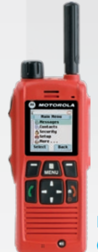
MTP850Ex (IECEx and ATEX certified)